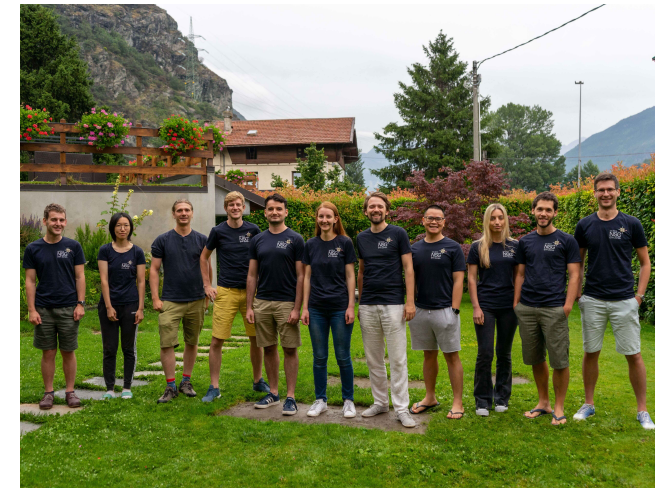
A subset of our group proudly showing our brand new colors at this year's retreat

Our yearly retreat brought us to Italy, close to Aosta. Besides brainstorming on research ideas, we used the time to reflect on work-life balance and how to manage stress. We discussed about research-specific sources of stress (e.g. the pressure to publish) and strategies on how to cope with them. This, a long hike, and the tasting of local delicacies meant we could come back to Zürich fully rejuvenated.