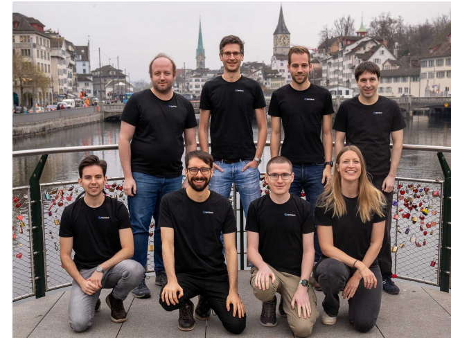
Our A-team posing (and freezing) next to NetFabric offices in downtown Zürich

This fall semester we embarked on a quest to release an online-based transcript of our lectures—a common student request. Doing so was an opportunity to start exploring how AI-powered tools can improve our teaching. Overall, I am quite happy with the outcome: check it out online!